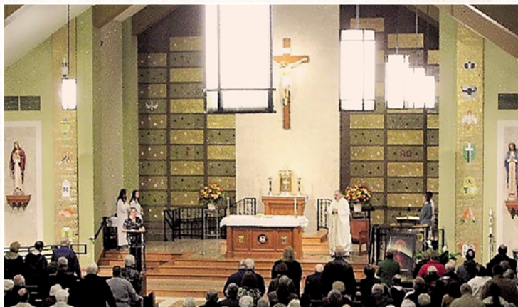
The first Mass held at Saint Elizabeth of Hungary Church , Pleasant Hills, following its renovation on Nov. 20, 2016