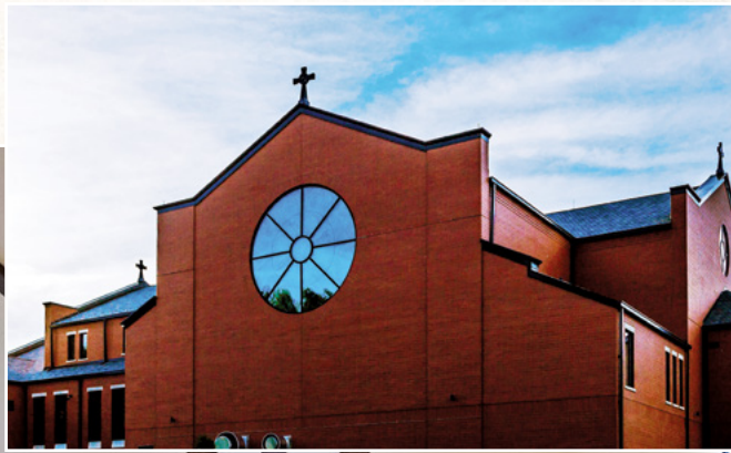
Saint Kilian Church, Cranberry, PA

Houses of Worship built and revitalized through sacrificial campaign gifts