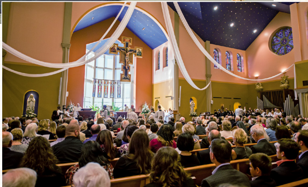
Dedication Mass – Oct. 22, 2017