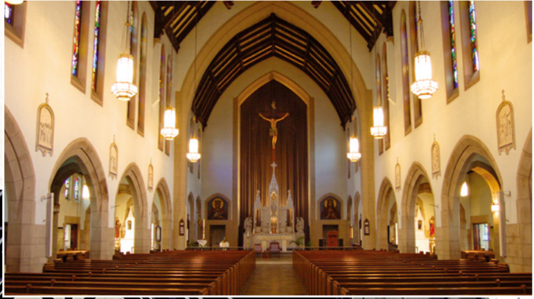
The interior of Immaculate Conception Church, Washington, PA, before and after its restoration in 2015