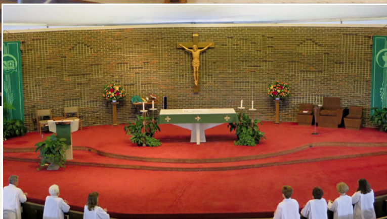
The sanctuary of Holy Trinity Church , Robinson, PA, was transformed in 2014